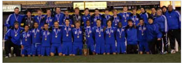
2011 Men's Division II State Soccer Champions!