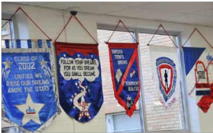
Carroll class banners hanging in the cafeteria.