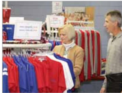
Alumni perusing through Carroll's new Spirit Shop, open during the 50th Anniversary Celebration.

Following Mass, all of the current and former faculty and staff members of Carroll High School joined together for a photo. So many smiles, memories and stories were shared as these individuals gathered! Then, the faculty and staff took their places in their former or current classrooms as alumni walked the halls as they did in their past, visiting their old friends and teachers and looking at the memorabilia displayed. Lunch was also available in the newly