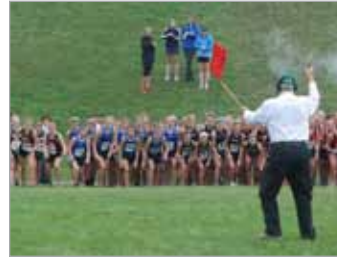
Women's Cross Country Team at the Midwest Catholic Championships

Once again, the Cross Country teams hosted the Midwest Catholic Championships on Sept. 24 at Indian Riffle Park in Kettering with another successful turnout! Carroll's team won the Men's Silver Division.