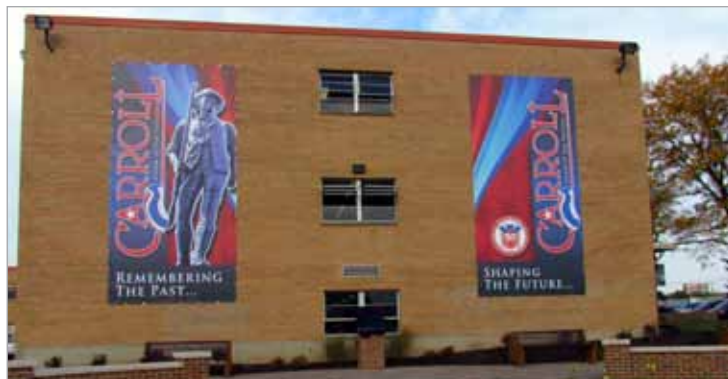
Carroll High School's Booster Plaza, dedicated Thursday, October 13th.