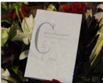
50th Anniversary Mass Program replicated to look similar to the original 1961 Dedication Program.