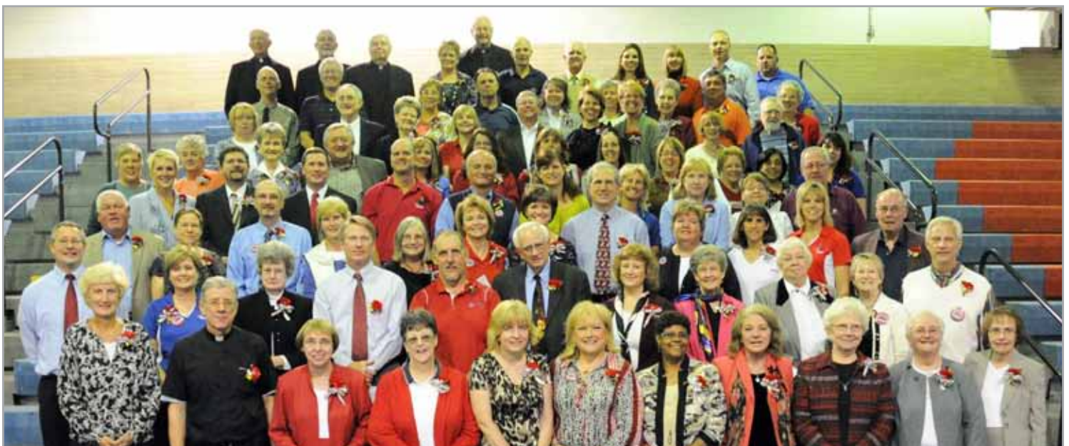
Carroll High School's current and former faculty and staff members present at Sunday's Mass and Open House.

On Sunday, the class of 1966 received the $100 reward to go towards their next reunion for having the most members present that day. One additional class contest still remains. The class with the highest level of participation for their class gift at the end of the 2011-2012 fiscal year will also receive $100 towards their next reunion.