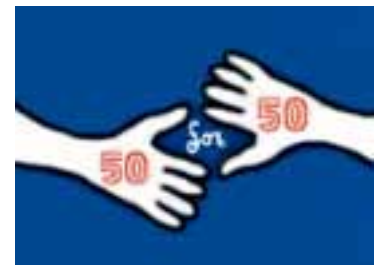
50 acts of service in honor of 50 years of Carroll's service to us