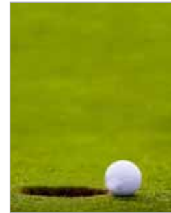
... just one stroke!