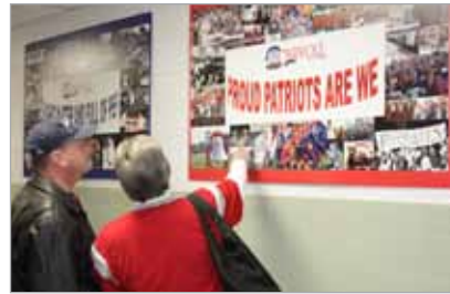
Friday night guests admiring the 50th Anniversary Memory Wall Banners.