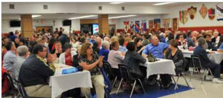
50th Anniversary Booster Plaza Dedication crowd in the cafeteria with the class banners in the background.

Hundreds of devoted long-time Patriots and their families began flooding inside around 4:00 p.m. Excitement filled the air as they passed the impressive plaza on their way inside and noticed the new Spirit Shop and 50th anniversary memory boards hanging in the hallway. The cafeteria was beautifully decorated and decked out with all of the class banners. Historical photos and memorabilia were also placed in the back of the room.