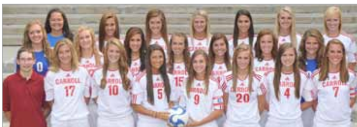
Women's Varsity Soccer Team