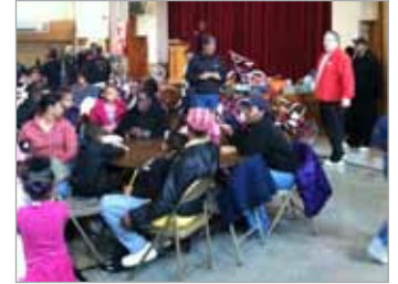
Families enjoying Christmas Party

sponsored numerous other ministries over the years including an after-school program for urban youth, an annual Christmas party for families who struggle to provide gifts for their children, and an annual Thanksgiving basket giveaway that averages between 300-400 turkeys and baskets per year. Carroll students provided more than $500 of donations in food and canned goods for the Thanksgiving program.