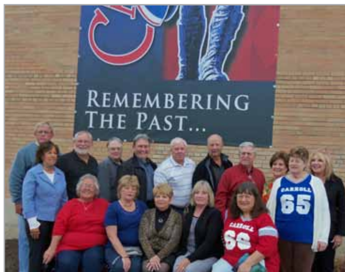
1965 and 1966 class members gathering around one of the benches they donated to the Booster Plaza, in honor of their parents.