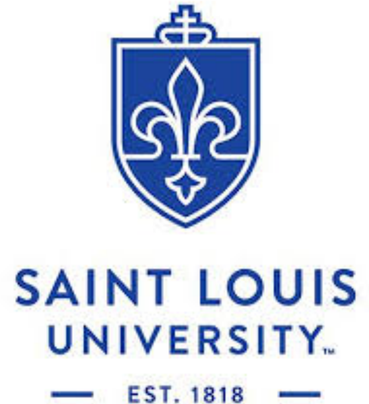
Master of Occupational Therapy: 2014

Pre-OT > Ultrasound Tech/ Radiology > Dental Hygiene> Undecided > Psychology