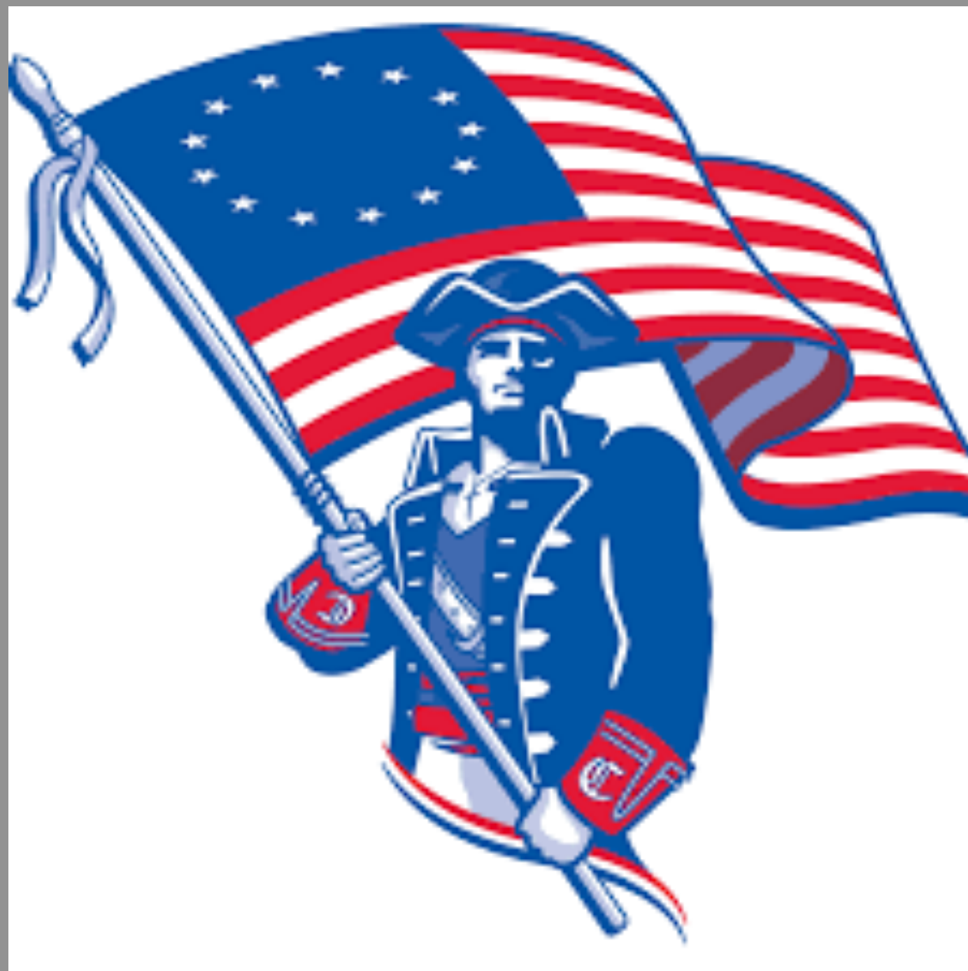
Carroll High School: 2008